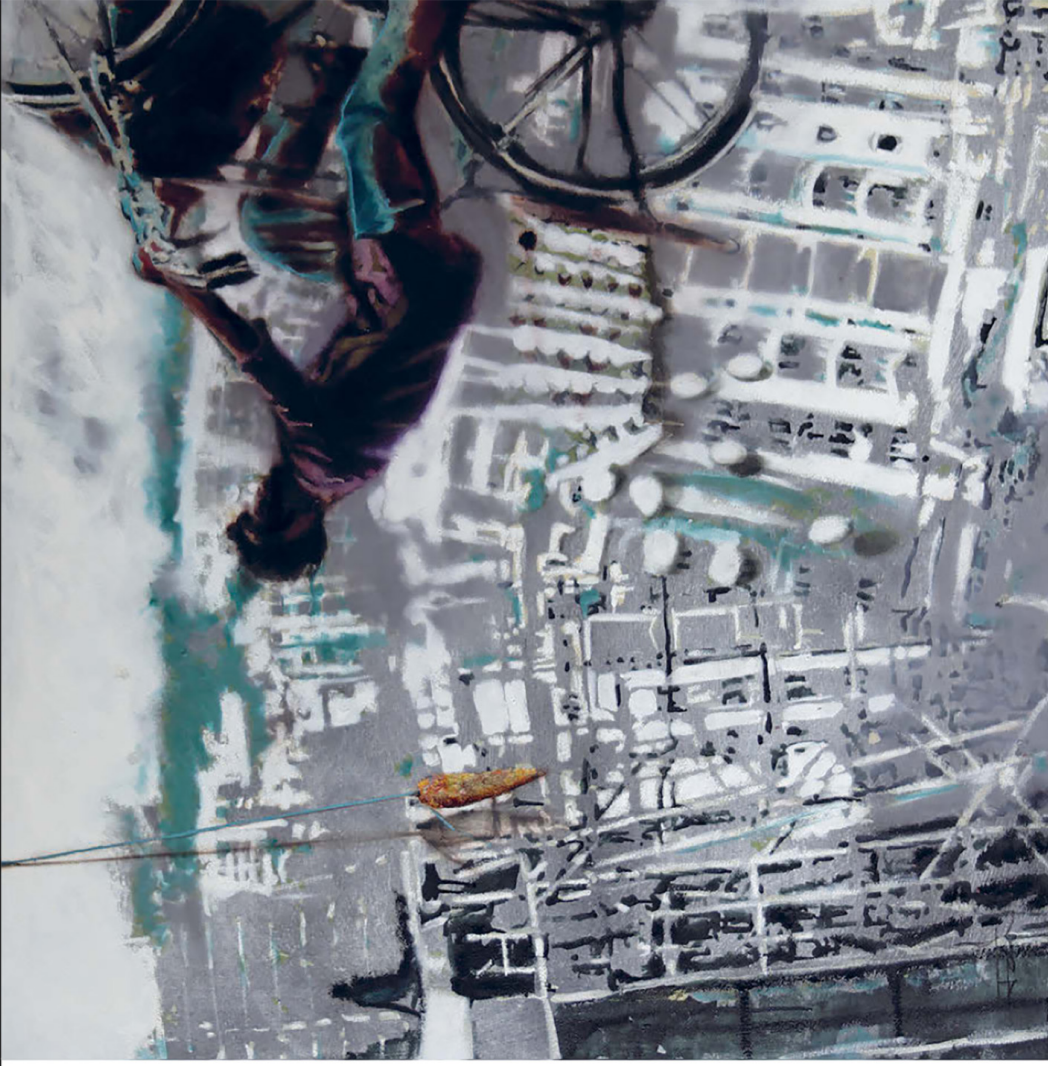
Left: Once Upon a Time in the East , 2011. Acrylic, oil & mixed media on canvas, 48 x 48 in. Above: Eggball Enterprise , 2006-07. Acrylic, copper leaf and oil on linen, 48 x 48 in.

Jaideep Mehrotra has been a significant presence in the Indian art world for the past four decades. He works across mediums like oil, acrylic, cast resin sculptures, giclee prints, site specific installations and video art. One of the pioneers of digital medium in India as an art form, Mehrotra has continually pushed the conceptual thresholds of his visual language to integrate different elements in his work, the historical with the contemporary and the traditional with the modern. He has had 23 solo exhibitions and has participated widely in many significant group exhibitions and workshops in India and abroad. His works are in prestigious collections worldwide.